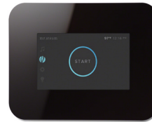
iSteam®3 Touch-Screen Control

Options vary from iSteam®3 , a state-of-the-art command system, to AirTempo® , a no-hassle and wire-free system. These controls boast features such as auto-start, audio control, multiple user profiles and even multilingual support.