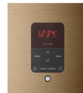
iTempoPlus® Keypad Control