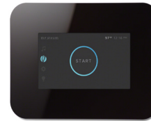
iSteam®3 Touch-Screen Control

Options vary from iSteam®3, a state-of-the-art command system, to AirTempo®, a no-hassle and wire-free system. These controls boast features such as auto-start, audio control, multiple user profiles and even multilingual support.