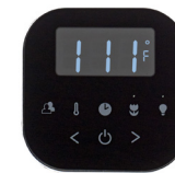
AirTempo® Wireless Control