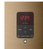
iTempoPlus® Keypad Control