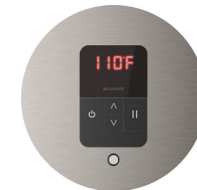
iTempo® Keypad Control