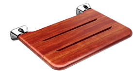
Wall Mounted Folding Seat